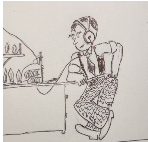
Ham radio....social distancing since 1905.