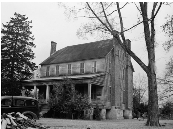
Homefield Plantation, Dalzell, Sumter County