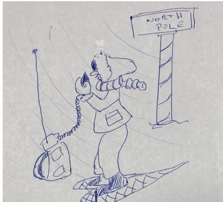
Winter Field Day overachiever